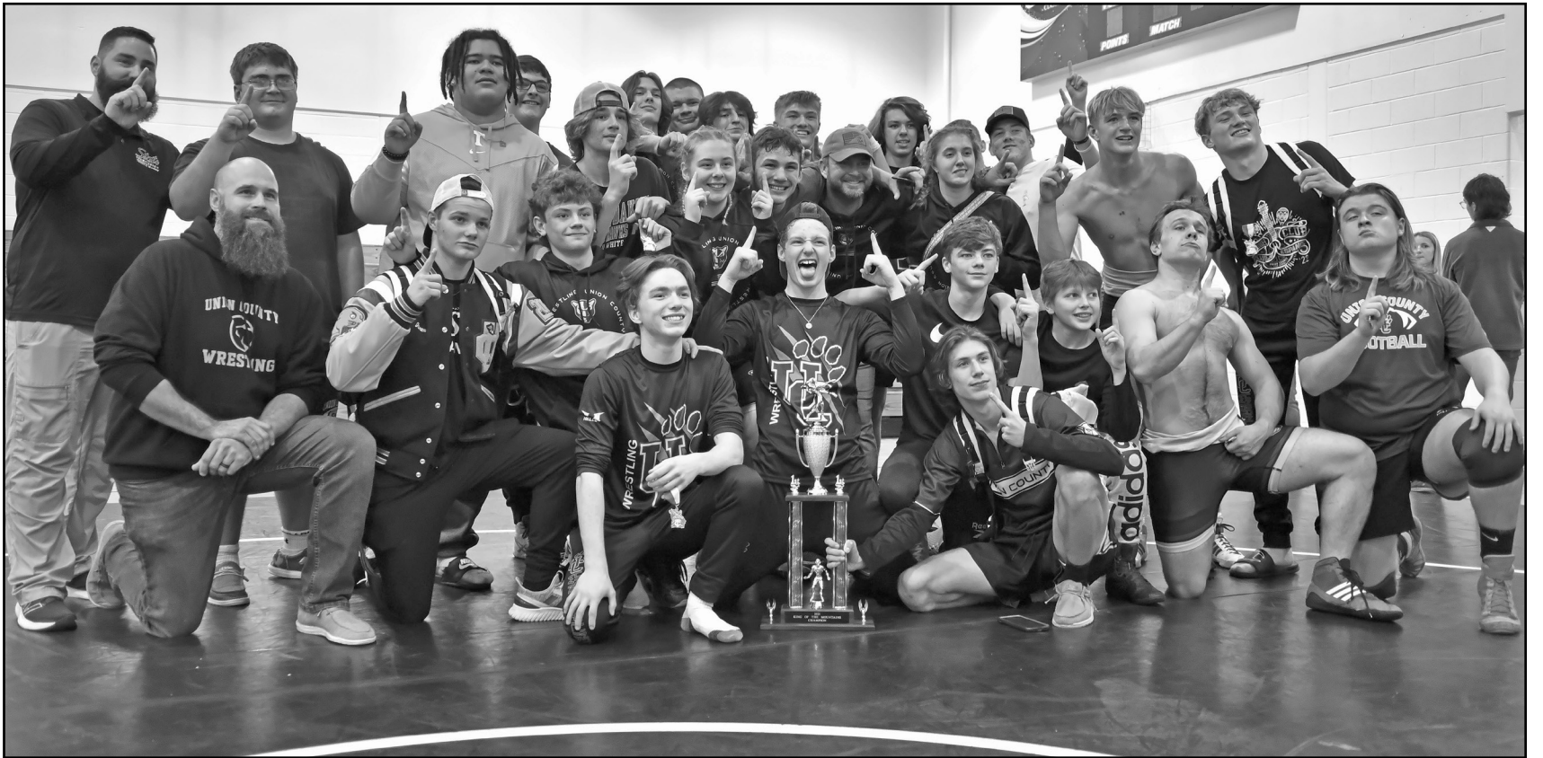
UCHS wrestling scored a program-defining victory over the weekend at Towns County High School's annual King of the Mountains tournament.

Heredia pinned Towns County's Zion Calhoun in the first round to begin the tournament. He picked up a 10-5